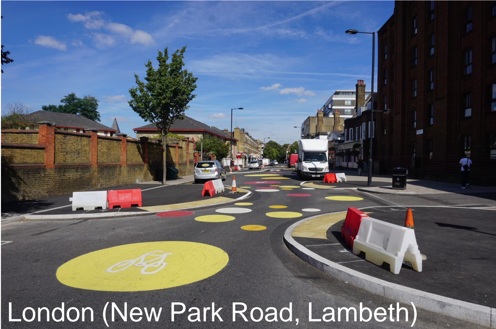
London (New Park Road, Lambeth)